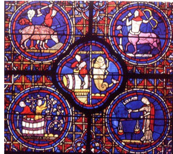
Chartres Cathedral, Zodiac Window, Detail of a Stained Glass Window. c. 1220. Photograph. San Marcos, California, n.d. Palomar College.

If you were a stained glass craftsperson, what shapes and colours would you use to tell a story? Design your own stained glass window and tell your epic story!