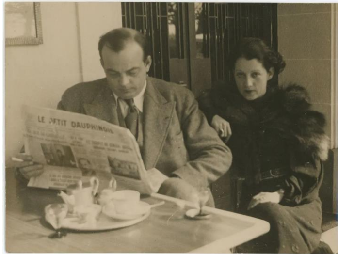
Caption: Antoine de Saint-Exupéry and his wife Consuelo visiting an air show

Please download high-resolution images HERE .