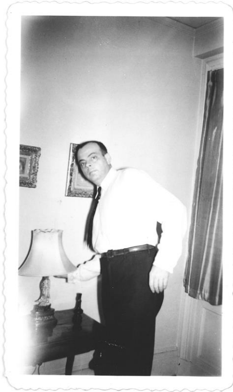
Caption: Antoine de Saint-Exupéry in Silvia Hamilton's apartment, a Canadian filmmaker, writer, poet, and artist