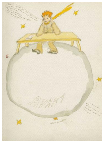
Caption: The Little Prince on a planet, scarf in the wind, sitting at a table

In addition, eight life-sized coloured sculptures inspired by The Little Prince will be on display and available for pre-order, offering collectors and fans a unique way to celebrate the enduring legacy of Saint-Exupéry's beloved masterpiece.