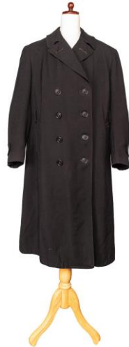
Caption: Antoine de Saint-Exupéry's military coat