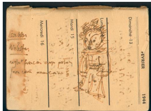
Caption: Sketch of a Little Prince