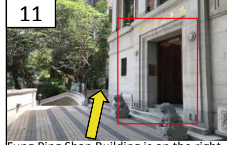
11 Fung Ping Shan Building is on the right. Walk past Fung Ping Shan Building and follow the small path (indicated by the yellow arrow) to reach T. T. Tsui Building