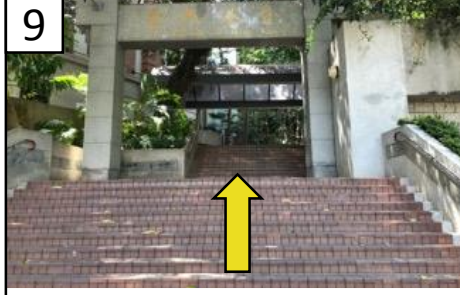
9 Go up the staircase.