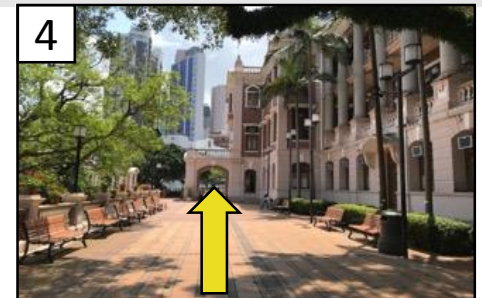
4 Walk past Loke Yew Hall.