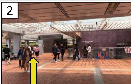
2 到達大學街後靠左， 往大學圖書館方向行走