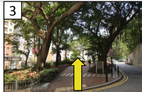
3 Walk towards Loke Yew Hall along the path.