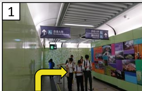
1 香港大學站 A2 出口， 使用升降機進入香港大學