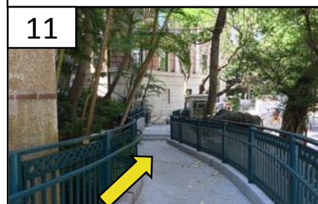
11 步出徐展堂樓地下後， 往左沿小徑走，即可到達馮平山樓