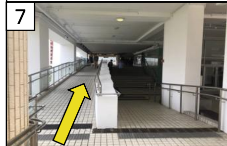
7 Follow the path that runs along the side of Knowles Building.