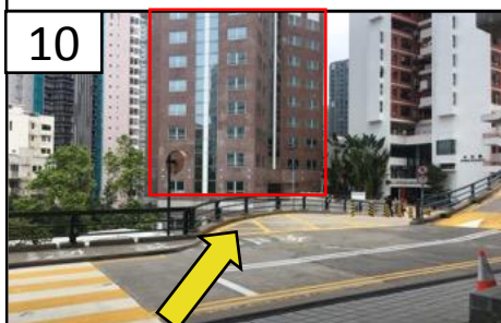
10 橫過斑馬線後前往徐展堂樓。 (此層入口為徐展堂樓3樓， 展覽廳位於1樓)