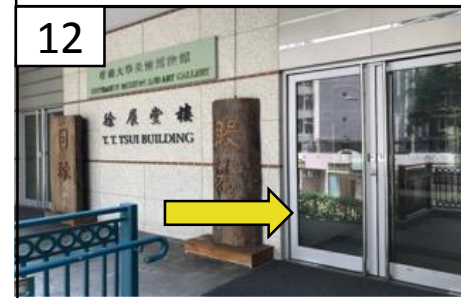
12 進入徐展堂樓。地下為博察茶座， 一樓為展覽廳，二樓為辦公室。