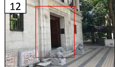
12 Enter Fung Ping Shan Building.