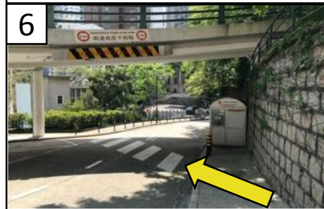
6 Cross the zebra crossing.