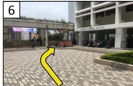
6 Go across Sun Yat-sen Place and turn right.