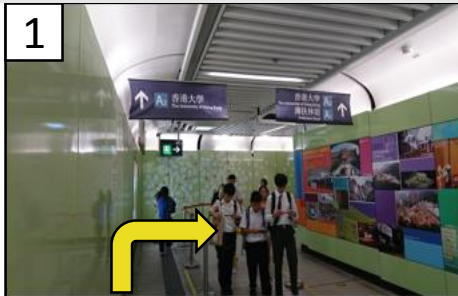
1 HKU Station Exit A2. Take the lift to the University of Hong Kong.