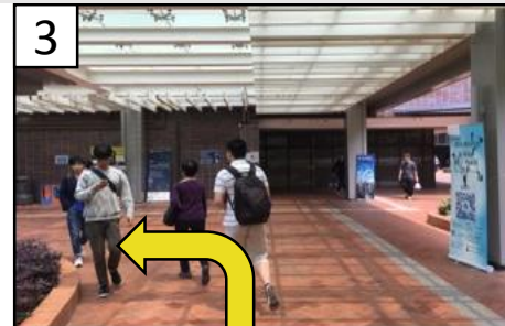
3 Turn left at the end of the University Street.