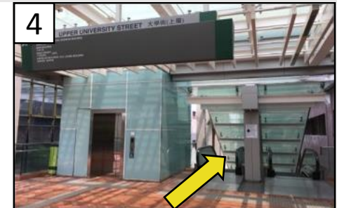
4 Take the lift or use the escalator to go down.