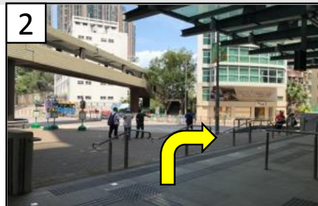
2 Turn right after exiting the lift.