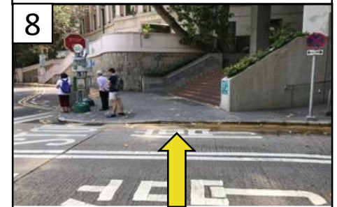
8 Cross the road at the end of the path.