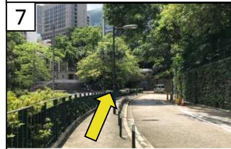
7 Follow the path that runs along the side of the road.