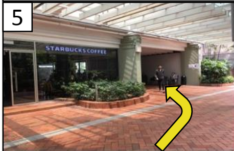
5 Walk past Starbucks to Sun Yat-sen Place.