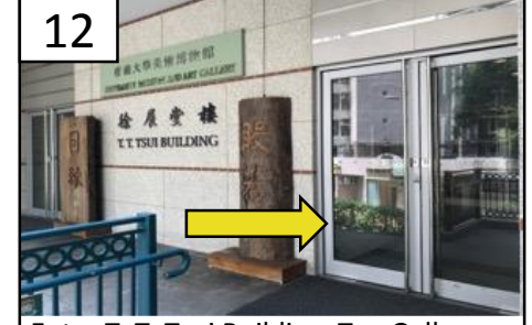
12 Enter T. T. Tsui Building. Tea Gallery is on the G/F while the exhibition area is on the 1/F. 2/F is the museum office.