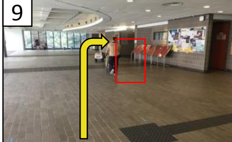
9 Take the lift at G/F lift lobby to LG2/F.