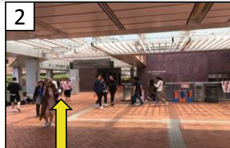
2 Keep left and walk towards the Main Library along the University Street.