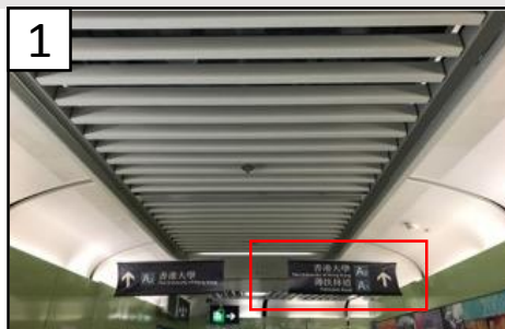
1 香港大學站A1出口， 使用升降機前往薄扶林道