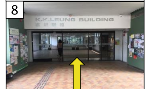
8 Enter K.K. Leung Building.