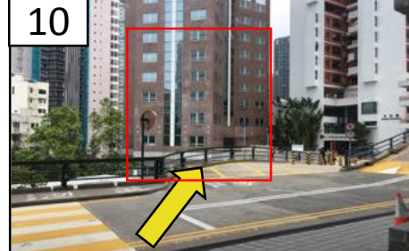
10 Cross the zebra crossing and head to T. T. Tsui Building (you are now on the 3/F and the exhibition area is on the 1/F).