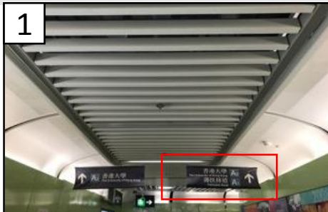
1 HKU Station Exit A1. Take the lift to Pokfulam Road.