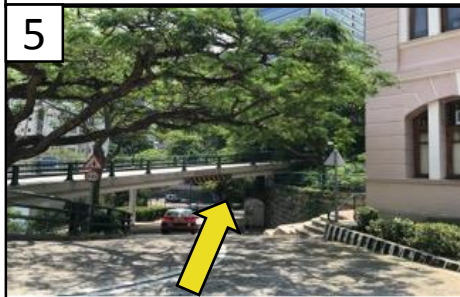
5 Walk down the slope.