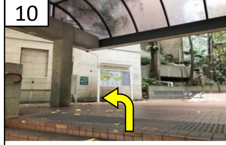
10 Turn left after you reach the platform.