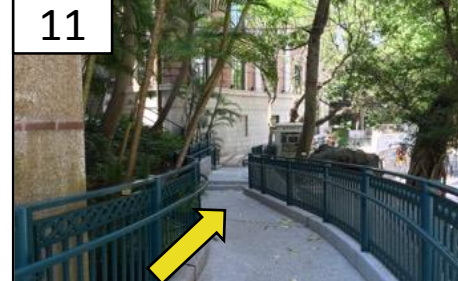
11 Exit T. T. Tsui Building on the G/F and turn left. Go along the path to reach Fung Ping Shan Building.