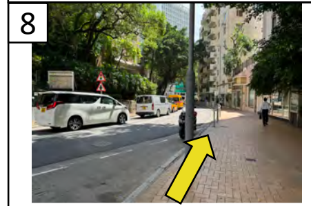
8 Walk along Bonham Road.