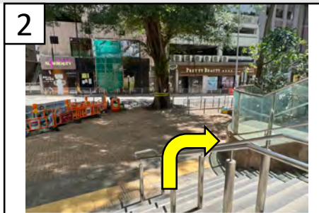
2 Turn right after exiting the lift.