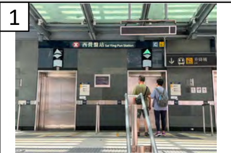
1 Sai Ying Pun Exit C. Take the lift to Bonham Road.