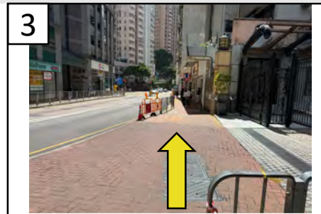
3 Walk along Bonham Road.