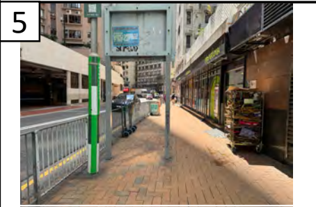
5 Walk along Bonham Road.