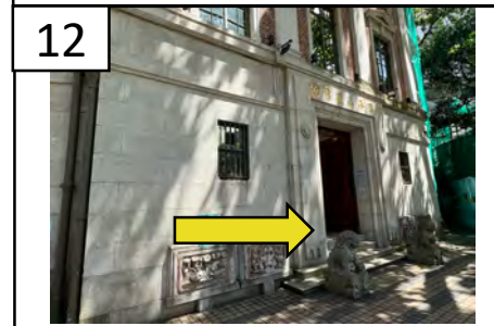
12 抵達馮平山樓入口。如要前往博物館 書店及徐展堂樓展覽廳，均請由此入 口入場，途經馮平山樓到達