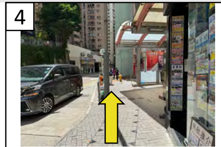
4 Walk pass the Centre Street escalator.