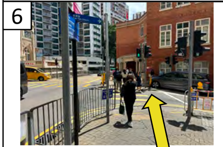
6 Cross the zebra crossing.