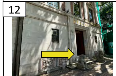
12 Arrive Fung Ping Shan Building. Please also enter through the Fung Ping Shan Entrance for the T. T. Tsui Building exhibition area and bookstore.