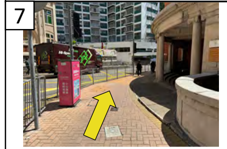
7 Walk past King's College.