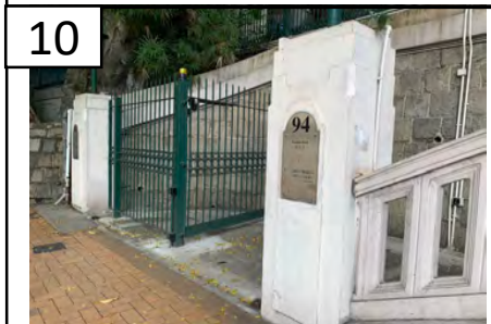
10 Arrive the Bonham Road gate.